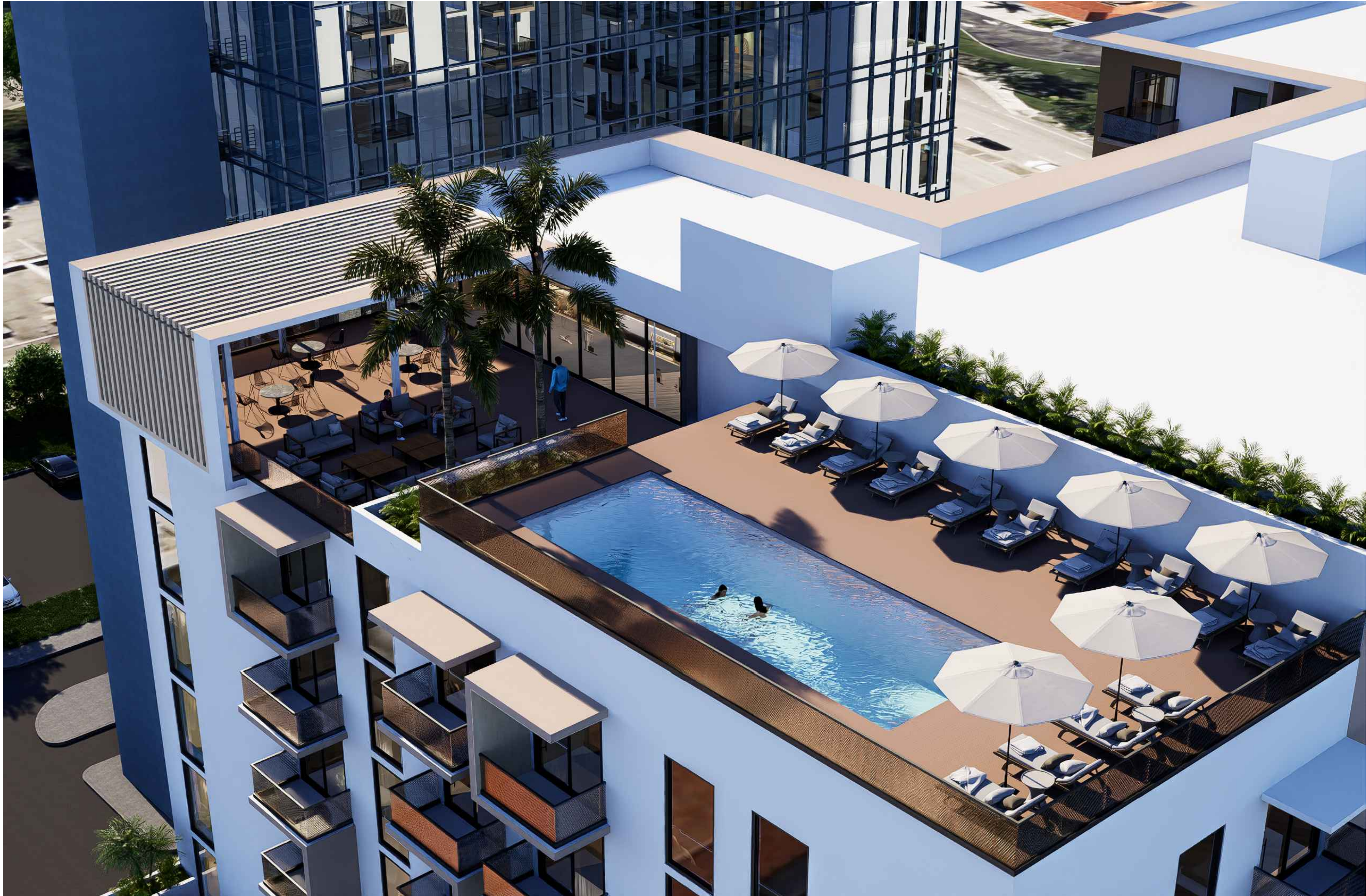
ZOOM-IN VIEW OF THE ROOFTOP POOL